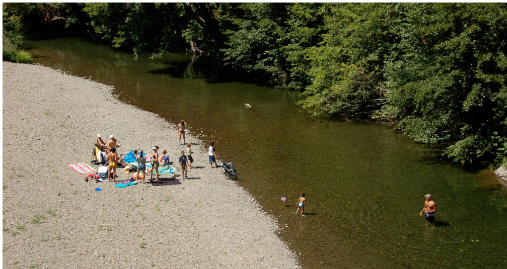
Summer enjoyment on the Navarro River at the Greenwood Road Bridge, Philo, CA.