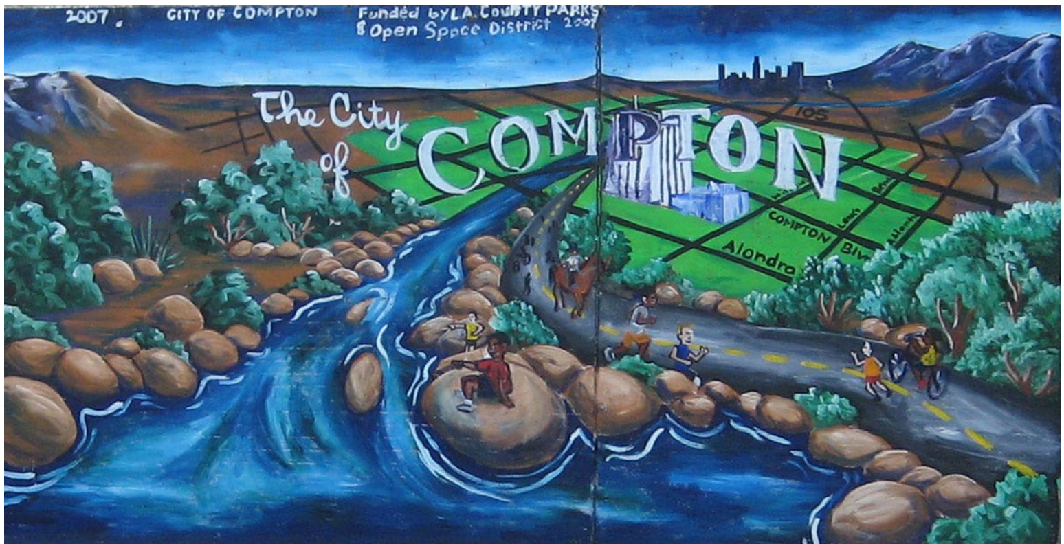
Mural along Compton Creek Trail.

This rail-trail project will focus on a proposed 80-mile rail banked recreational trail between McCloud and Burney with connections to national forest and state park lands, the Pacific Crest National Scenic Trail, and ultimately extending to the communities of Mount Shasta and Weed. RTCA will work with local partners, the Rails to Trails Conservancy, and the community to develop a compelling vision and conceptual trail plan.