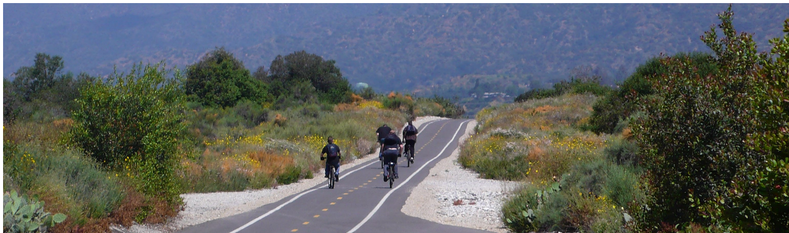
Cyclists riding along the San Gabriel River Trail through the Santa Fe Dam Recreation Area in Irwindale, California.